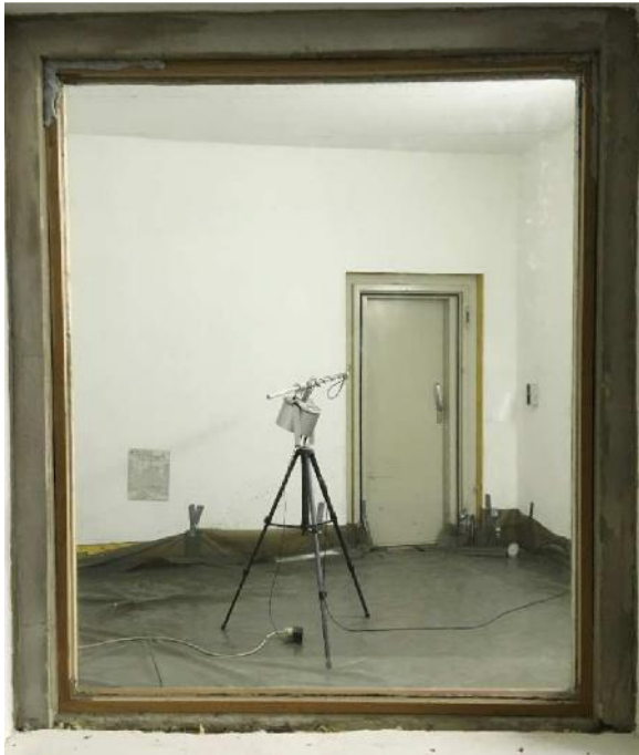
Figure A.2.1: tested glazing (sender space side)