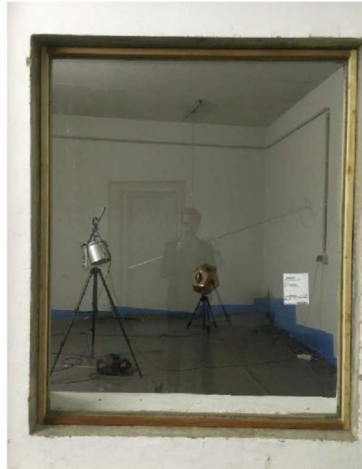
Figure A.2.2: tested glazing (receiver test side)